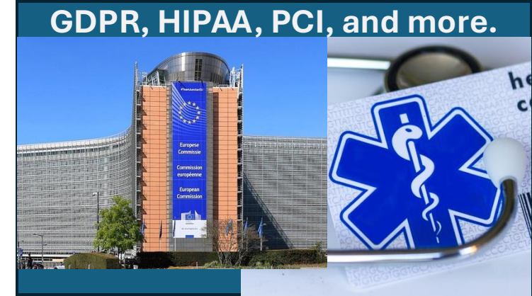
EU Headquarters

As part of the engagement, we can work with you to improve your Cybersecurity Risk Management, Governance, and Board Reporting.